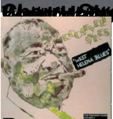
Roosevelt Sykes - West Helena Blues