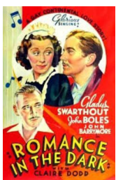
Romance in th Dark, poster, 1938

Swarthout with her costars warbled five songs. The best is The Nearness of You . Hoagy Carmichael wrote music with lyrics by Ned Washington.