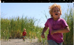
God Bless the Child (film)