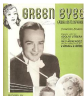
Green Eyes, cover

Tuesday, 25 September 2012 15:11 - Last Updated Friday, 13 March 2015 16:24