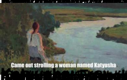
Game out strolling a woman named Katyusha