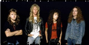
Metallica - Fade To Black (Live at The VH1)